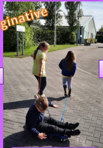
"If we work together to pull, it is easier."