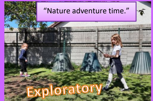
"Nature adventure time."