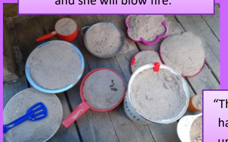
"This is spicy wicy food you have to eat while you are under our control Laura."