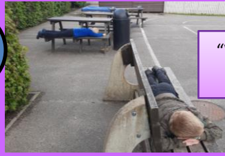
"We needed a nap."