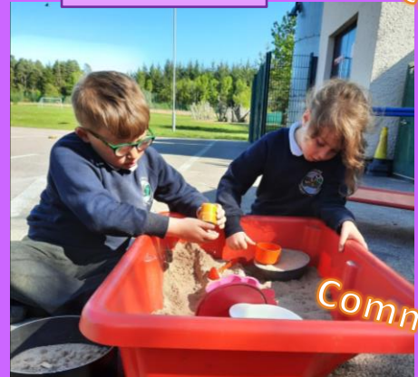
"Ghost peppers are the hottest and she will blow fire."