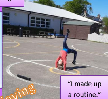
"I made up a routine."