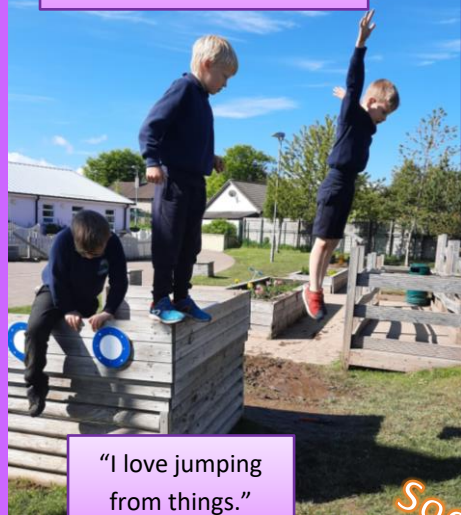
"I love jumping from things."

"What is a dog's favourite dinosaur film?"