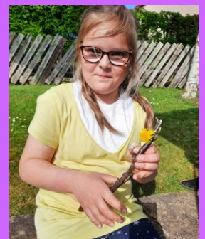
"We are making wands."