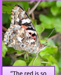
"The red is so pretty inside."