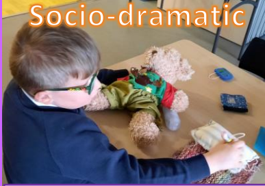
"I am the doctor and making sure all the teddies are okay."